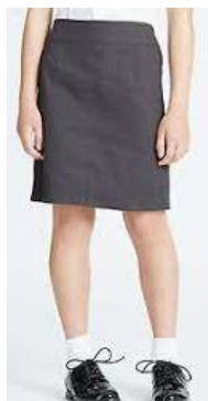
New school skirt (Trutex GST Gisburn tartan skirt)